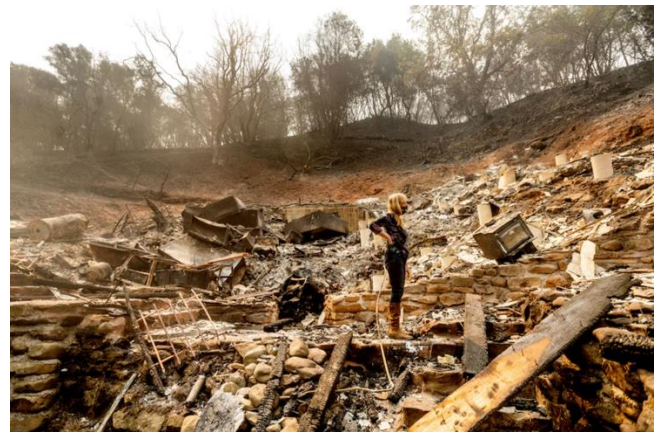
Pam, who declined to give her last name, examines the remains of her partner's home in Vacaville, Calif., on Aug. 21. The residence burned as the LNU Lightning Complex fires ripped through the area on the night of Aug. 18.

In seven days, the California blazes have charred nearly 1 million acres, according to Cal Fire, more than tripling the area burned during a typical fire season (a little more than 300,000 acres). The area burned is larger than Rhode Island.