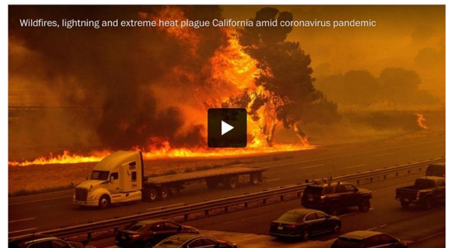
Thousands were under evacuation orders in Central and Northern California as dozens of major wildfires continued to ravage parts of the state on Aug. 19.

California has seen a significant uptick in large-wildfire activity because of a combination of climate change, land-use practices and other factors. Large fires have also increased across other parts of the West, which climate studies tie to human-caused climate change that alters the timing of precipitation, makes summers hotter and vegetation drier, and leads to more days with extreme weather that enable fires to spread rapidly.