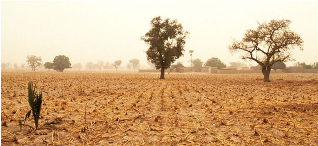
Has global warming reached a tipping point?