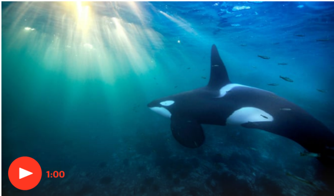
▲ WWF report warns annihilation of wildlife threatens civilisation – video

Chemical pollution is also significant: half the world's killer whale populations are now doomed to die from PCB contamination. Global trade introduces invasive species and disease, with amphibians decimated by a fungal disease thought to be spread by the pet trade.