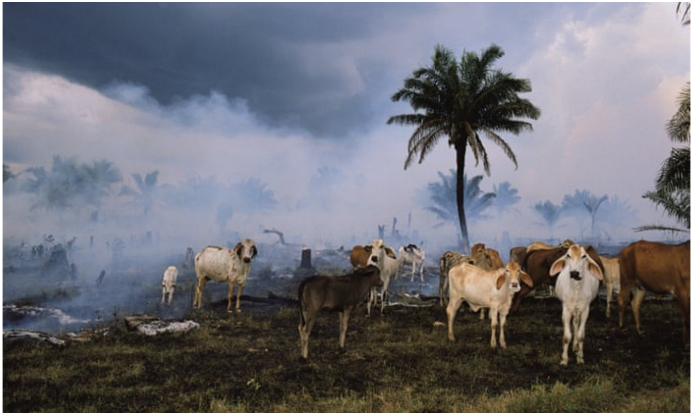
Cattle in the Amazon rainforest.

Damian Carrington Environment editor, @dpcarrington Mon 29 Oct 2018 20.01 EDT Last modified on Tue 30 Oct 2018 11.08 EDT