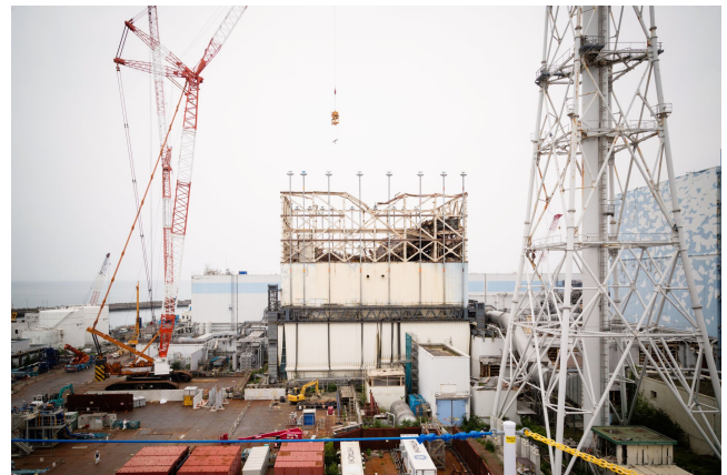
The Unit 1 reactor at the Fukushima plant, whose top was blown away when it melted down on March 11, 2011.

Access to the plant is easier than it was just a year ago, when visitors still had to change into special protective clothing. These days, workers and visitors can move about all but the most dangerous areas in street clothes.