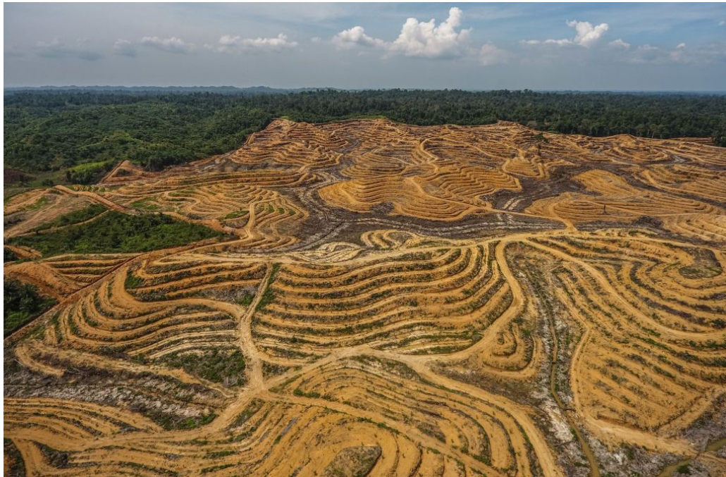
An illegal palm oil plantation seen inside the boundary of the Gunung Leuser National Park in Aceh, Indonesia, on June 6, 2018.

Earth's cornucopia of life has evolved over 550 million years. Along the way, five mass extinction events have caused serious setbacks to life on our planet. The fifth, which was caused by a gargantuan meteorite impact along Mexico's Yucatan coast, changed Earth's climate, took out the dinosaurs and altered the course of biological evolution.