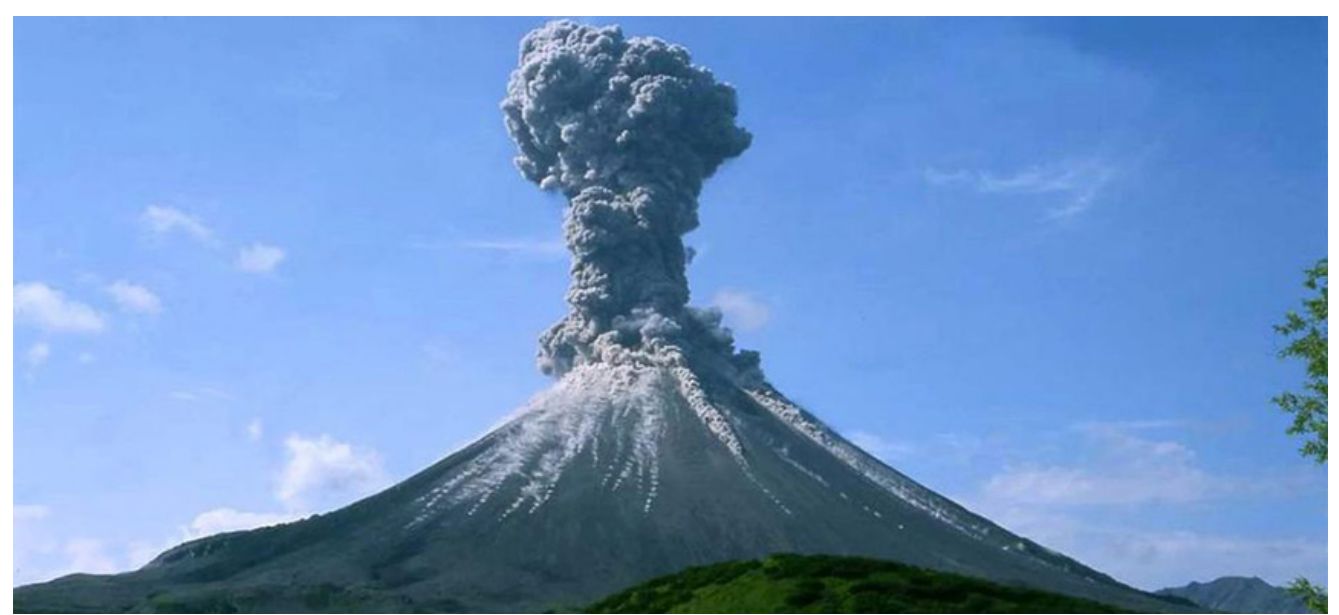
When volcanoes erupt, a large amount of material from the Earth's interior, including extraordinary amounts of carbon dioxide, are released into the atmosphere.